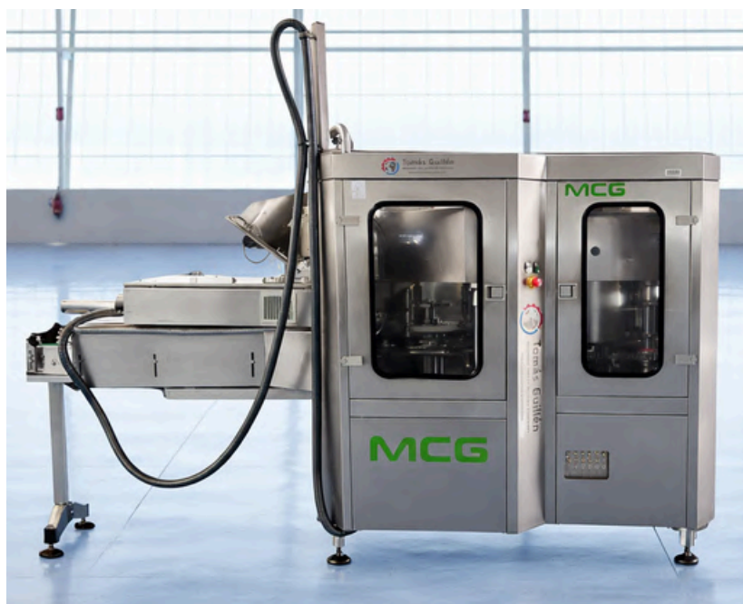
MCG R-110 CAN SEAMER