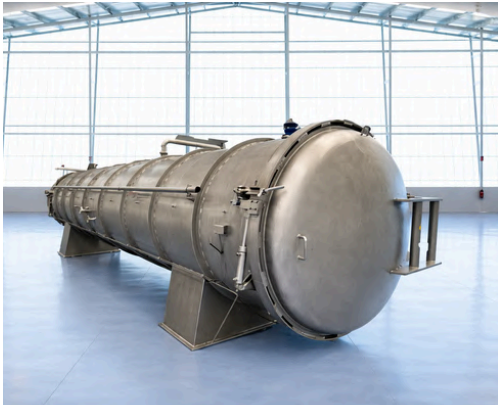
8-BASKET AUTOMATIC COOKER WITH