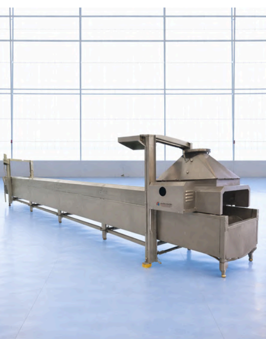
MECALSA THERMAL OIL FRYER