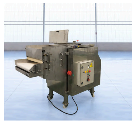
OMAR INOX STRIP, LOG OR RINGS CUTTER