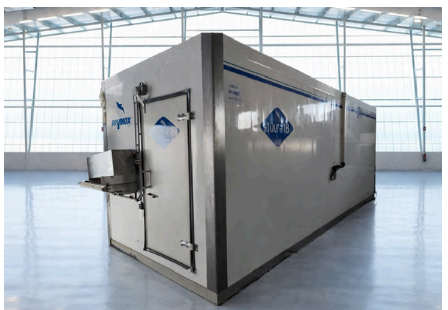
PALINOX IQF LINEAL DRYING TUNNEL