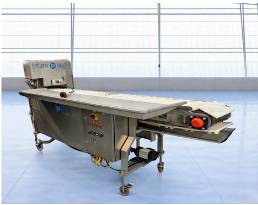
S/S GRUPO HRG SLICER