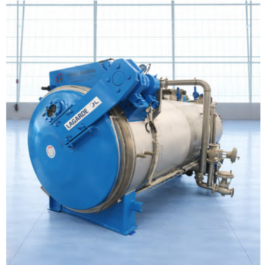
LAGARDE 4-BASKET STATIC AUTOCLAVE