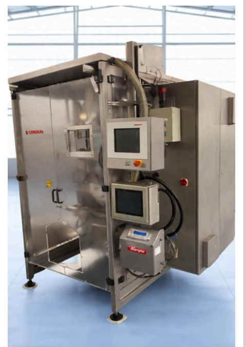
ROVEMA FILLING MACHINE FOR BAGS