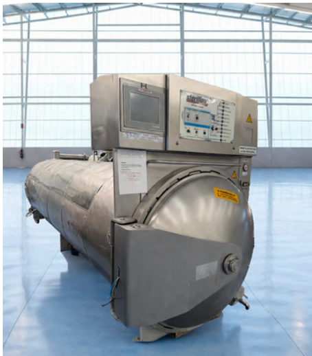
BARRIQUAND STERIFLOW 6-BASKET STATIC AUTOCLAVE