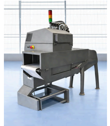
S/S METTLER T. X-RAY DETECTOR