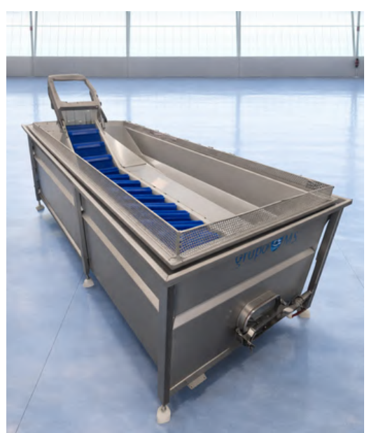
GRUPO HRG FEEDING TANK