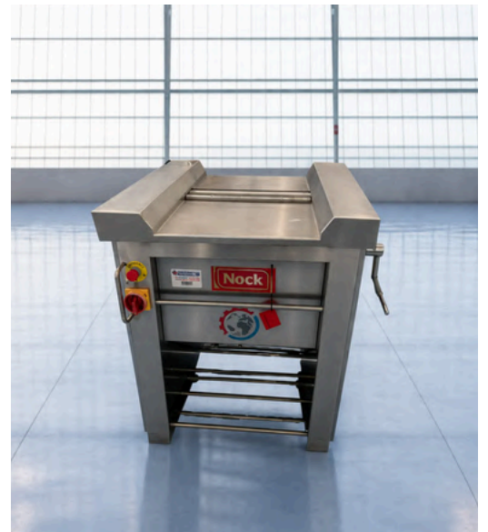
NOCK FISH PEELER