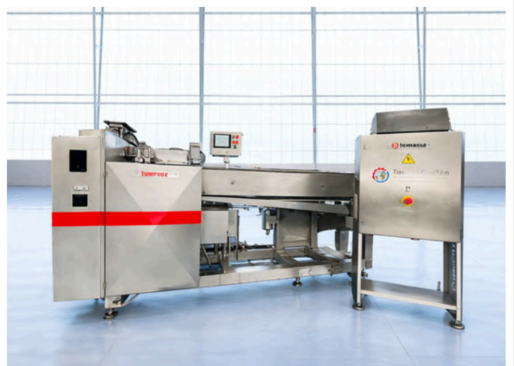
HERMASA TUNIPACK-500 PACKING MACHINE