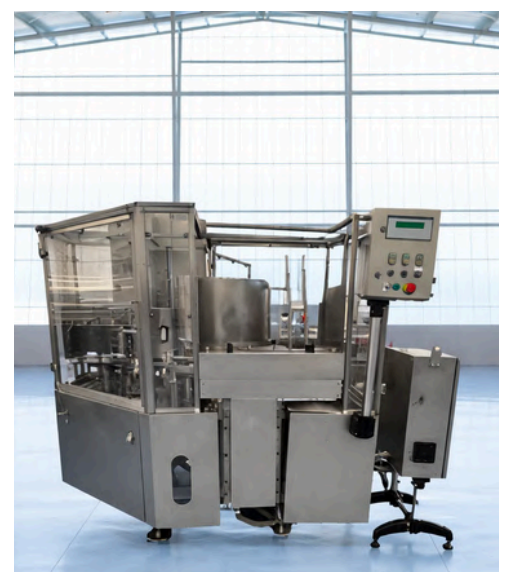
SOMME 444 MILLENIUM CAN SEAMER