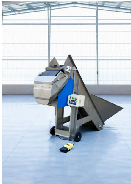
WEIGHING AND FILLING MACHINE MULO T