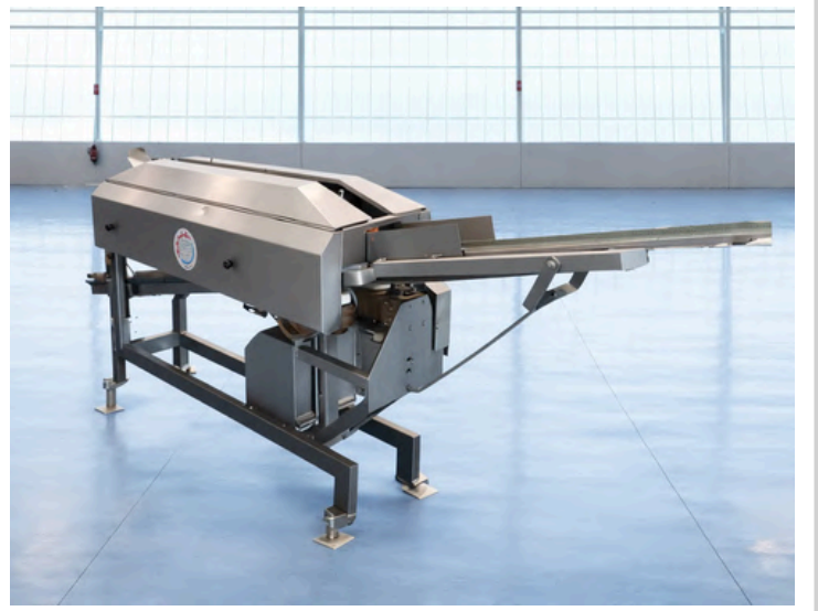
S/S BADER EVISCERATING AND FILLETING MACHINE