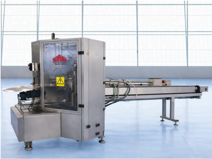
HERFRAGA SM-200 TUNA PACKING MACHINE