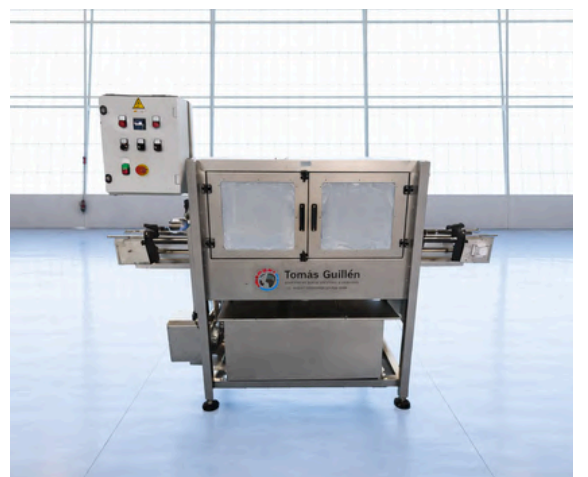
S/S TOMÁS GULLÉN DOSING MACHINE