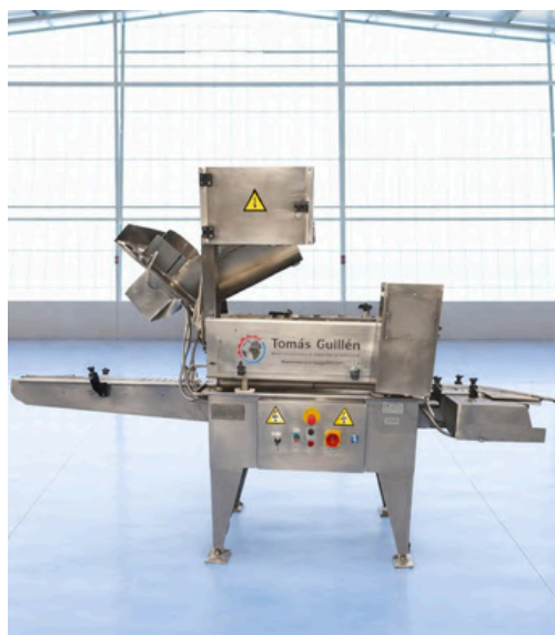
S/S EMERITO 1.8 JAR CAPPER