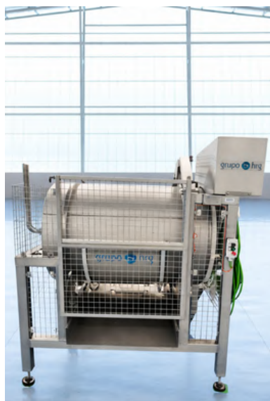
GRUPO HRG WASHING AND CURLING MACHINE FOR CEPHALOPODS