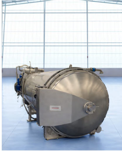
BARRIQUAND STERIFLOW 5-BASKET ROTARY AUTOCLAVE