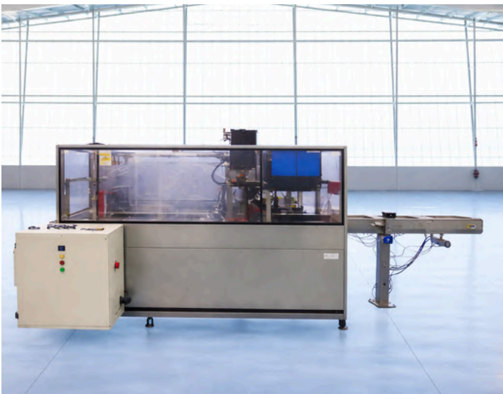
CARTONING MACHINE PACK-1