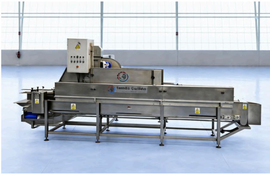
TOMÁS GUILLÉN UNIVERSAL FILLER