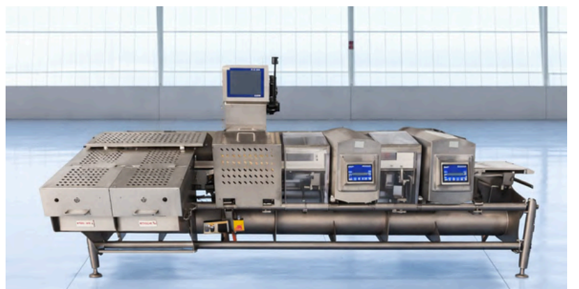
SAFELINE DOUBLE METAL DETECTOR WITH CHECK WEIGHER