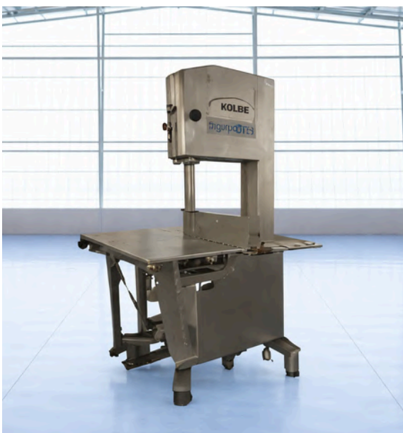
KOLBE K440 BAND SAW