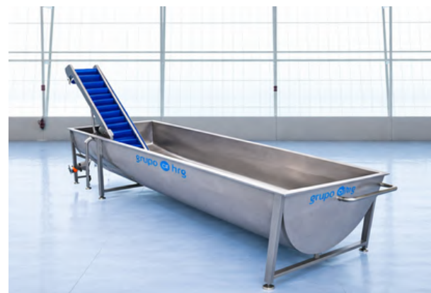
GRUPO HRG LINEAL DEFROSTER FOR FISH