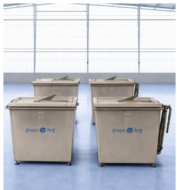
GRUPO HRG COOKER / TANK 1.100 L