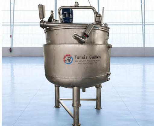
KLOPPER BOTTOM JACKETED TANK WITH AGITATOR